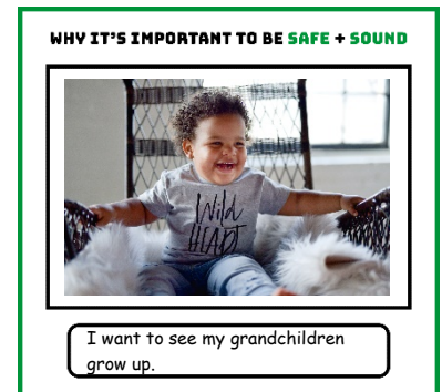
Framing Safety example

Begin framing safety and health conversations by asking managers and workers to share a photo that depicts why it's important for them to come home safely from work each day. Display photos in a visible place or scan and post on your intranet site to remind managers and workers about the importance of safety. Copy and distribute the graphics on pages 4 and 5 to frame photos and write in a small description about why the image was chosen. Photos can be inserted electronically with the instructions listed in the graphic or they can be printed out and taped to the inside of the frame.