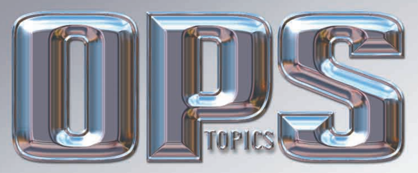
Editor's Note: The following accounts are from actual mishaps. They have been screened to prevent the release of privileged information.

Aircrew members face many hazards in the air, but what about the hazards on the ground? Here are a few cases where the aircraft and other objects collided when they shouldn't have.