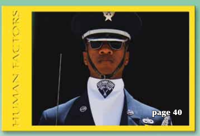
40 Great Expectations

EDITOR'S NOTE-The views and opinions expressed in this journal are those of the authors alone and do not necessarily reflect those of the United States Department of Defense, the United States Air Force or any other government agency. Editorial content is edited, prepared and provided by the Wingman staff.