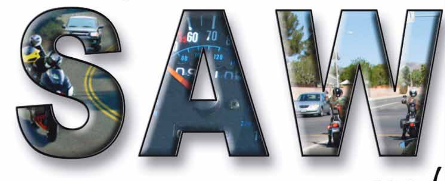
TECH. SGT. JOHN T. HALE 820th Red Horse Squadron Nellis AFB, Nev.

I shouted, "What a knucklehead! You're going to get yourself killed!" as the motorcycle flew past me, weaving in and out of traffic. Another sport bike raced in pursuit, nearly smashing into the concrete wall and barely slipping down the off ramp.