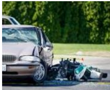
PMV4 – LEFT